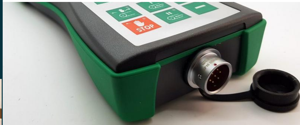
WEIPU Projects- Test & Measurement