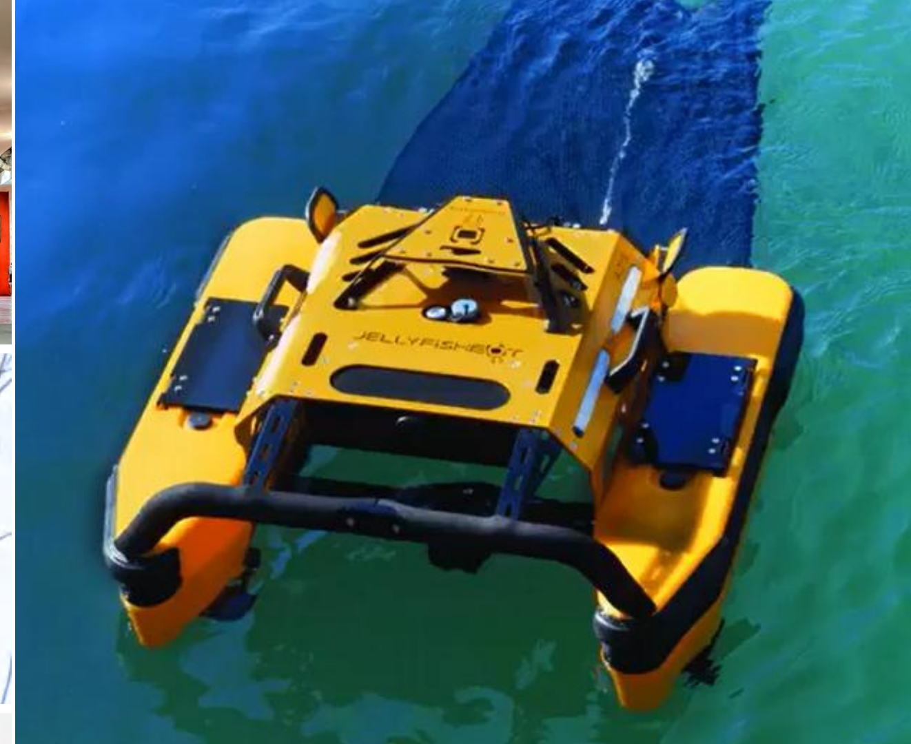
WEIPU Projects- Robotics