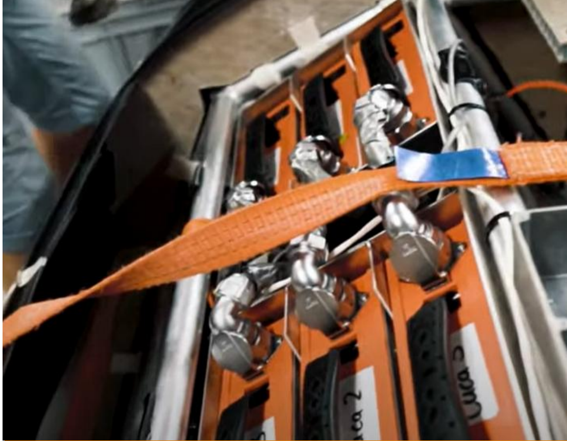
WEIPU Projects- Battery related