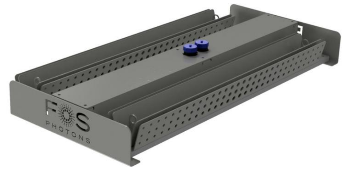
WEIPU Projects- LED & Lighting