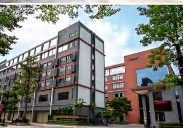
WEIPU Factory Guangdong, China