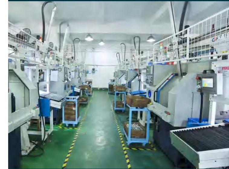
CNC Machining Center