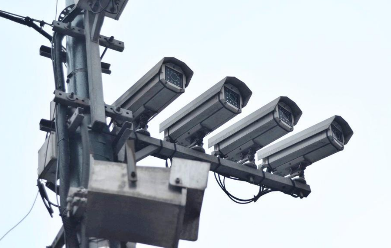
WEIPU Projects- CCTV Camera