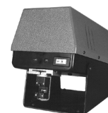
Part # 931800-1