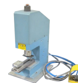
Part # 312522-1