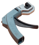
Part # 58074-1