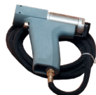
Part # 58075-1