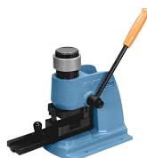
Part # 58024-1