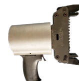
Part # 58075-1 (MTA-100) 58576-1 (MTA-156)