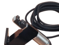
Part # 58338-1